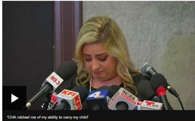
'CHA robbed me of my ability to carry my child'

The second baby boy allegedly comes from the egg and sperm of a third, unrelated couple. Court filings reportedly say the birth couple ceded custody of the child, and that the clinic has made contact with his biological parents - although they have not come forward publicly.